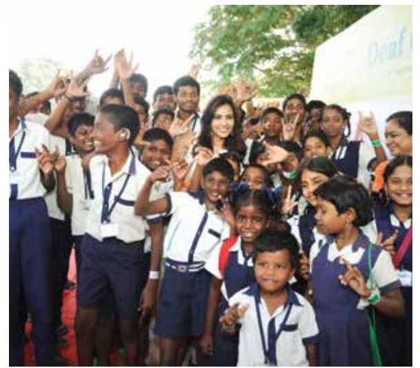
Picture Time - students strike a pose with actress Priya Anand