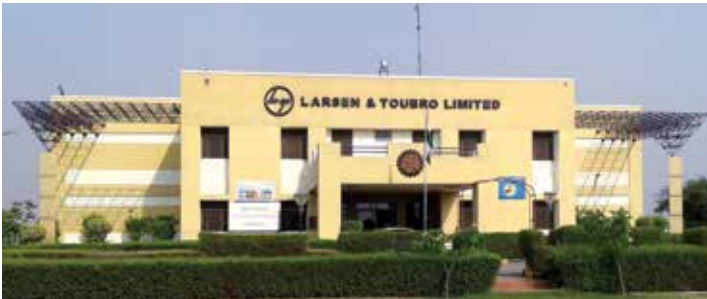
CSTI - Pilkhuwa

L&T Construction Skills Training Institute (CSTI) - Pilkhuwa (Delhi region), won the prestigious 'Golden Peacock National Training Award' 2017.