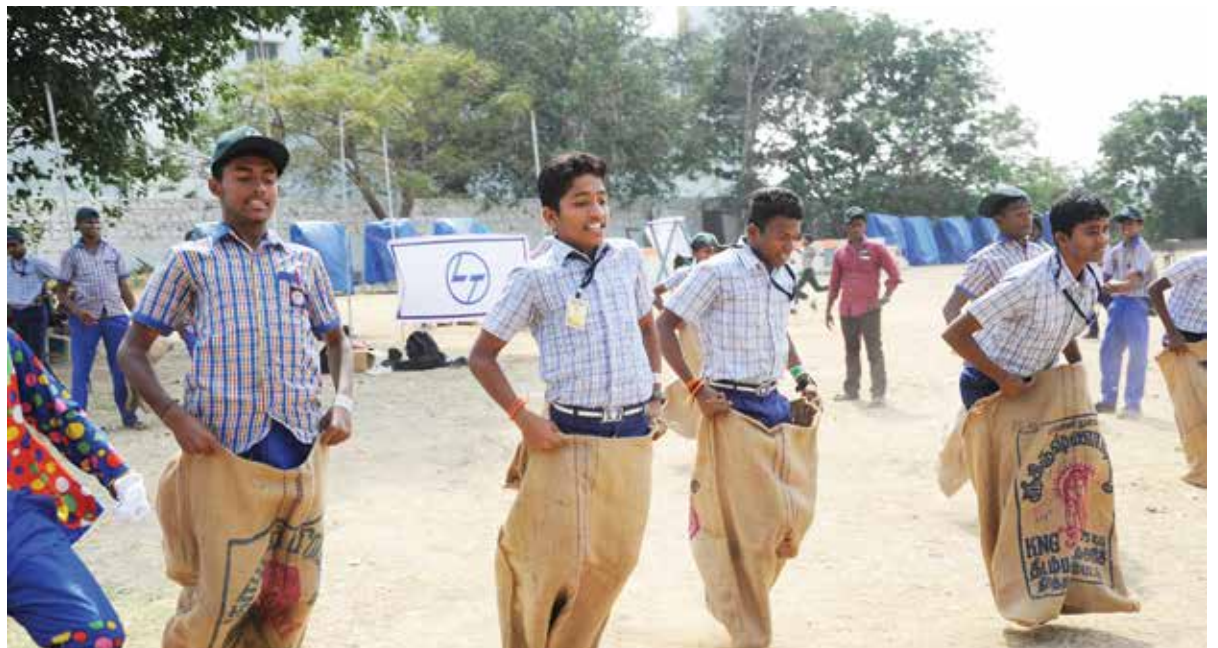
Sack race - acing the race