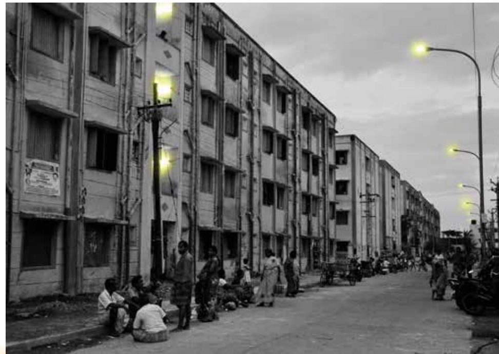
A view of Kannagi Nagar