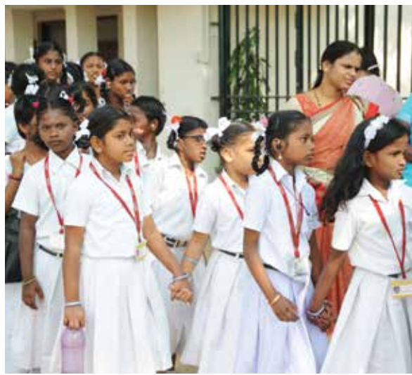
Girl Power - powering little girls

Later during the event, Ms. Priya Anand, actress, greeted and motivated the children.