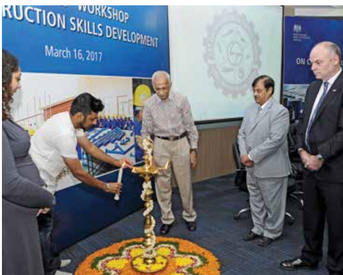
Lamp Lighting ceremony at the workshop