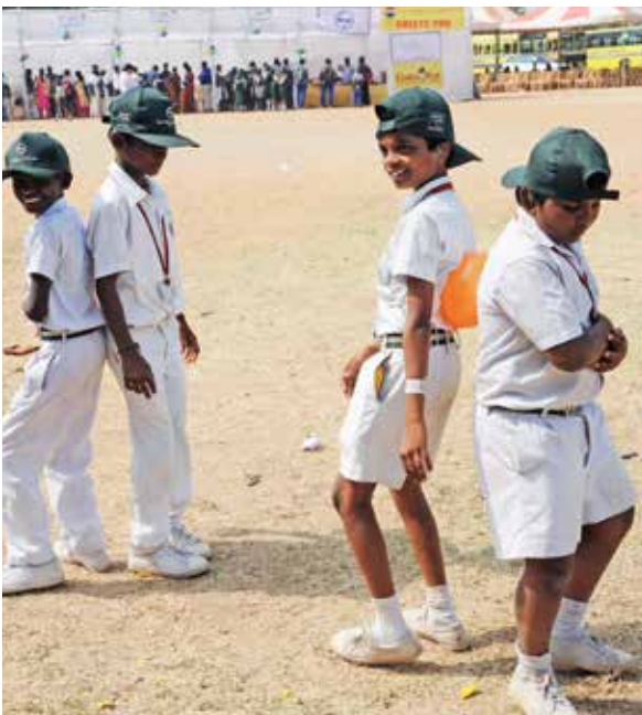
Strike a swag - student pose