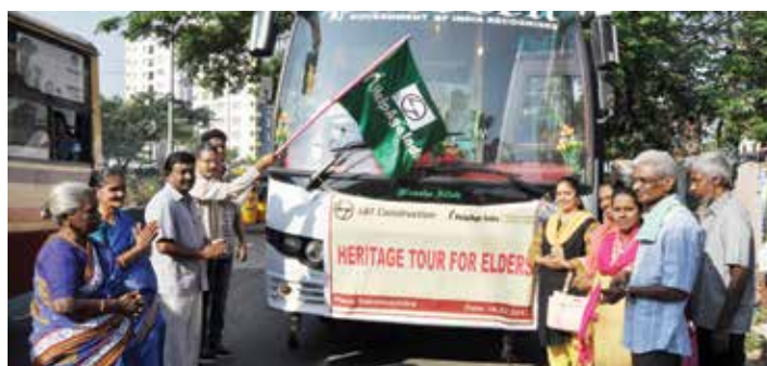
Flagging off the Heritage Tour