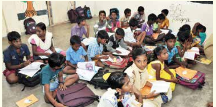
Students of the evening tuition centre