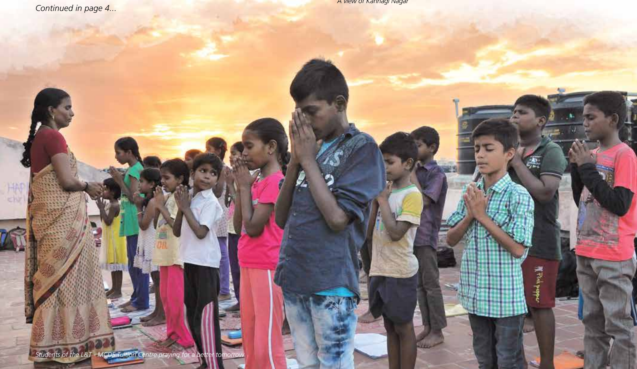
Students of the L&T - MCDS Tuition Centre praying for a better tomorrow