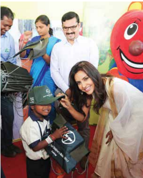
Actress Priya Anand interacting with a student