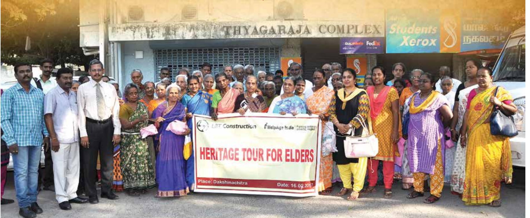
All geared up for the Heritage Tour - senior citizens along with L&T and HelpAge India officials.