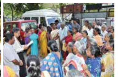
Senior citizens all grouped together for the tour