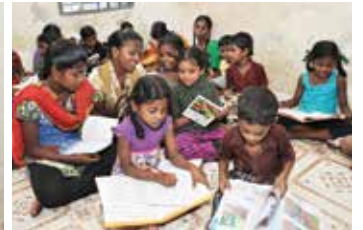
Children taking solace in books