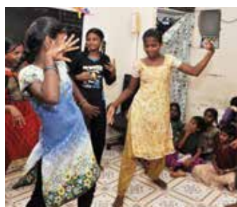
Children break into an impromptu dance