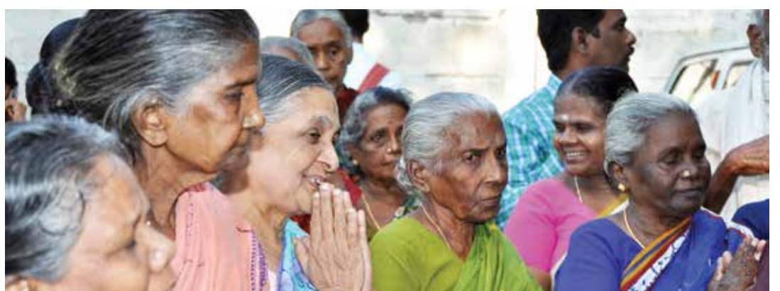
When emotional smiles say it all