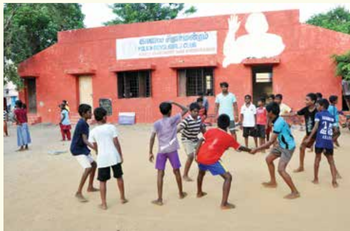
Playing along: Students outside the evening tuition centre