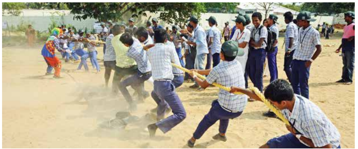
Tug of war - battle of the brawn