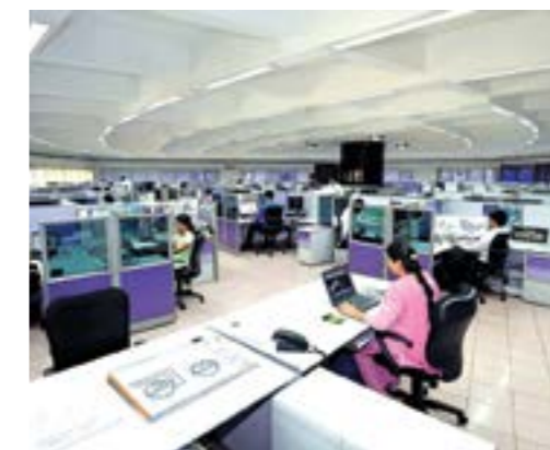
Design engineers at work