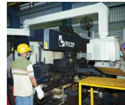
Heavy duty machine