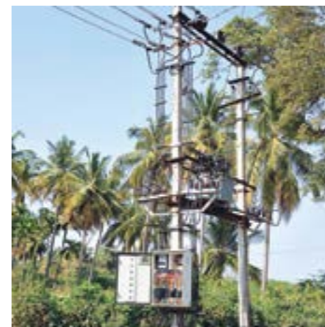
Demand side management through RLMS unit