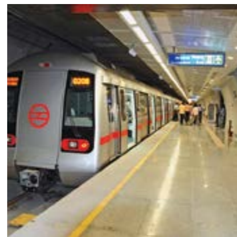
Electrification for a metro station