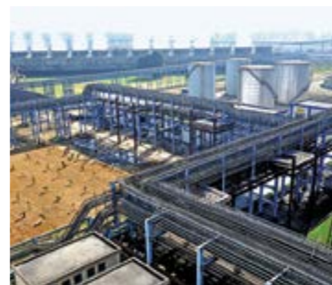
Cable tray installations at Jindal power plant