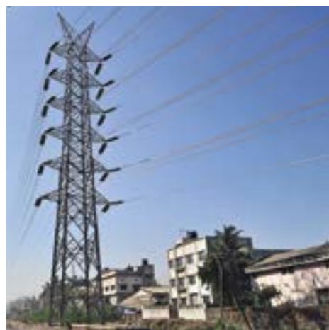
Multi-circuit narrow base transmission line tower for Mumbai

From the snow-clad heights of the Himalayas (3200 m above sea level) to the vibrant plains and the deserts of the Middle East, L&T has demonstrated its expertise in executing complex transmission line projects. L&T's unique canvas of strengths cover design, manufacture and supply, to construction, testing and commissioning of EHV power transmission lines. L&T offers turnkey solutions for the construction of unique narrow base towers that occupy less space that are ideal for cities and microwave communication towers. A remarkable achievement in this sector is the commissioning of a 471 m high guyed mast communication tower, the tallest in India.