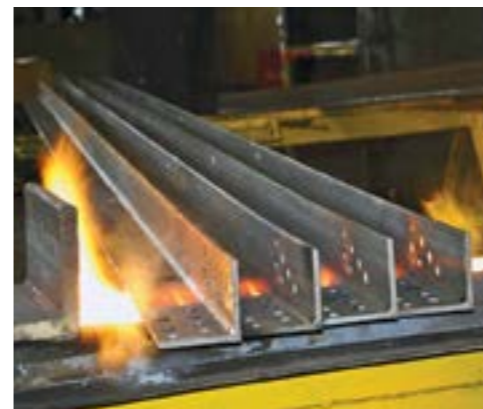
Temperature controlled systems