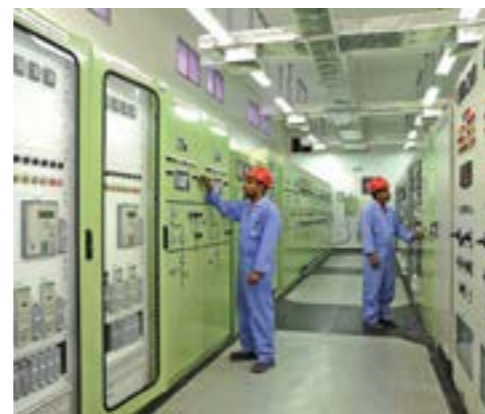
Control panels at a substation