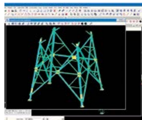
3D image of a tower