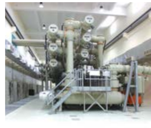
400/220/132 kV substation at Izki in Oman