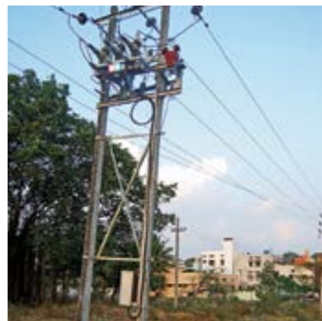
Auto recloser and sectionaliser works

L&T undertakes power quality improvement projects in India under various schemes launched by the Ministry of Power / Rural Electricity Corporation. Continuous improvements in quality of work and safety are highlights of L&T's success in such projects. With a strong project management team spread across various States, L&T is poised to play an active role in distribution reform projects. In the smart grid sector, L&T offers comprehensive solutions for turnkey electrification.