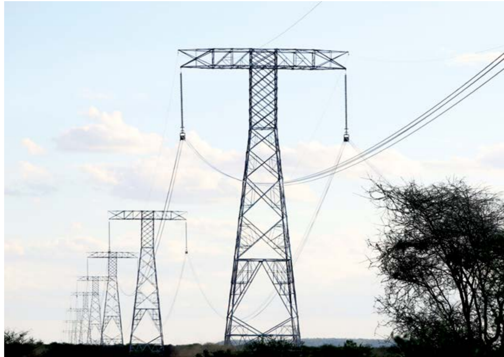
500 kV HVDC Ethiopia - Kenya interconnect – Largest in Africa