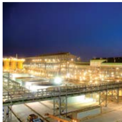
Electrification for a zinc plant