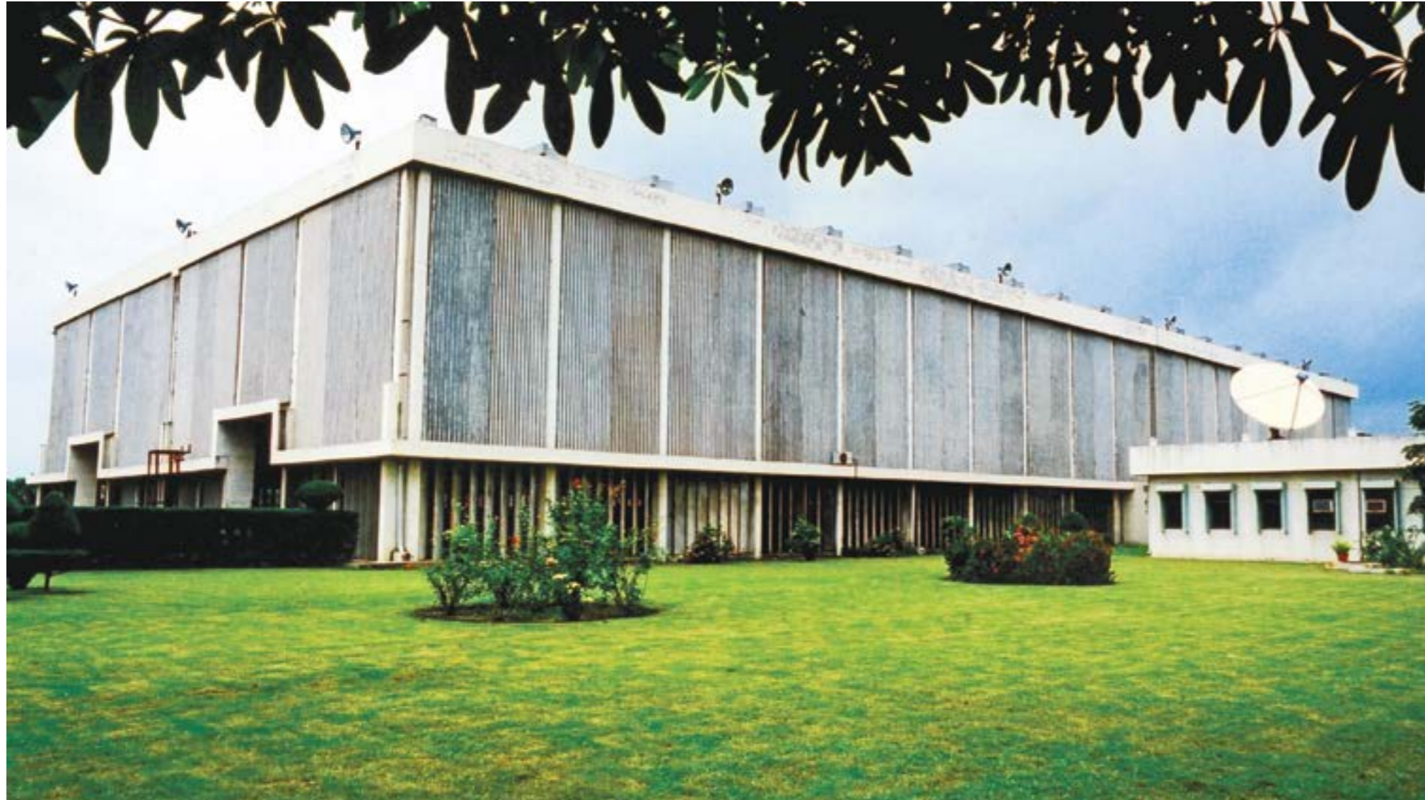
Transmission line tower factory at Pithampur