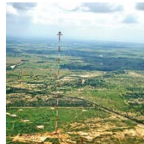
471 m high guyed mast communication tower - the tallest in India