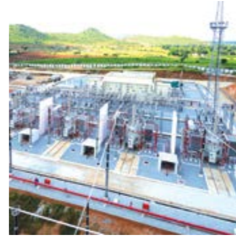
India's first STATCOM at NP, Kunta, Andhra Pradesh