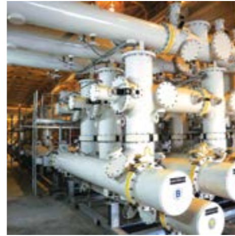
400 kV GIS switchyard at Chennai