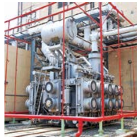
Installation and synchronization of transformer for a power plant