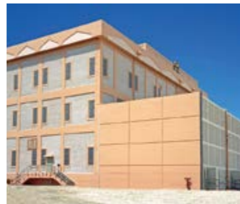
132/22 kV primary substation at Saadiyat Island in Abu Dhabi