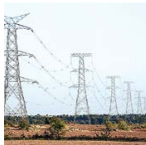
765 kV D/C transmission line at Kudgi