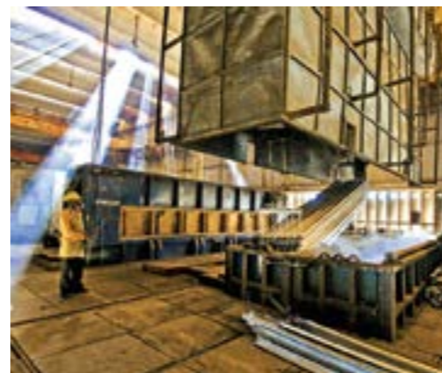
Galvanizing in progress