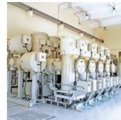
132 kV GIS for Salalah power plant, Oman