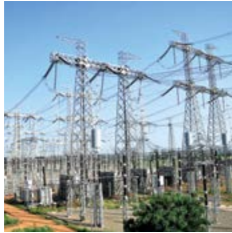
765 kV ultra high voltage AIS at Unnao