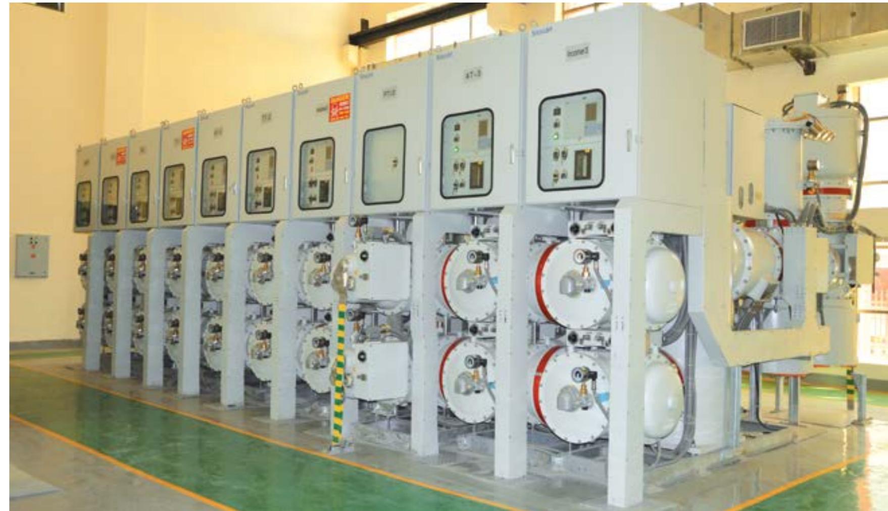
Receiving substation powering Lucknow Metro

With a track record of 32150 MW of Balance of Plant (E-BoP / I-BoP) services, L&T provides cost-effective one-stop solutions comprising supply, installation, testing and commissioning.