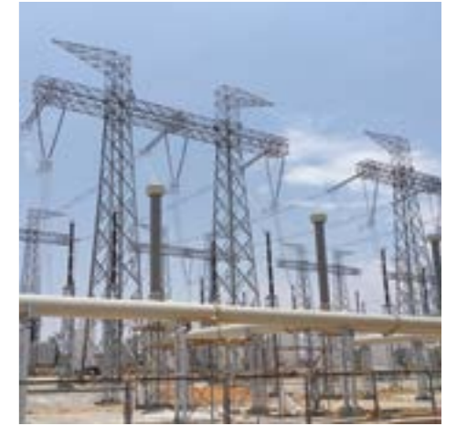
765 kV GIS, Hyderabad