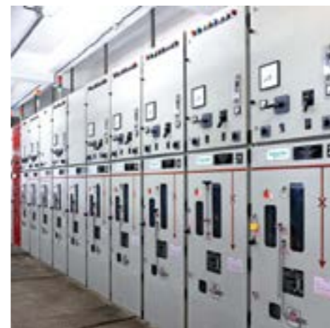
Switchgear panels for a steel plant