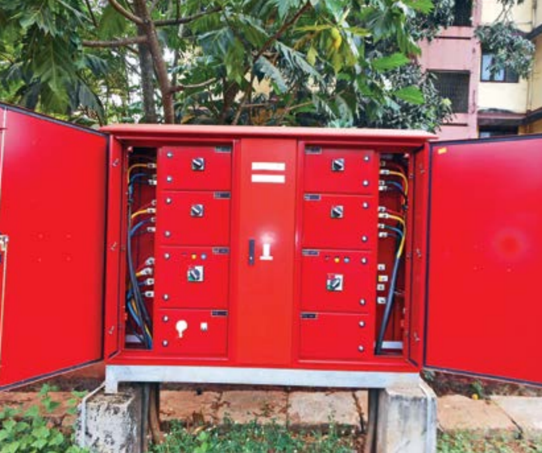
Power control panels

Accelerated Power Development and Reform Project in Aurangabad