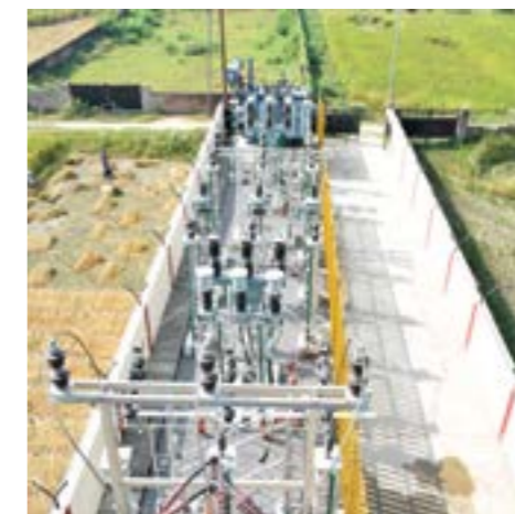
Restructured Accelerated Power Development & Reform Programme, Varanasi, India