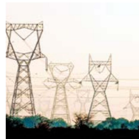
765 kV Sipat - Seoni transmission line