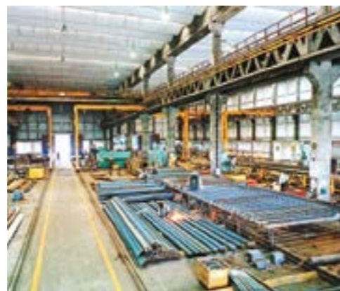
Transmission line tower factory at Puducherry