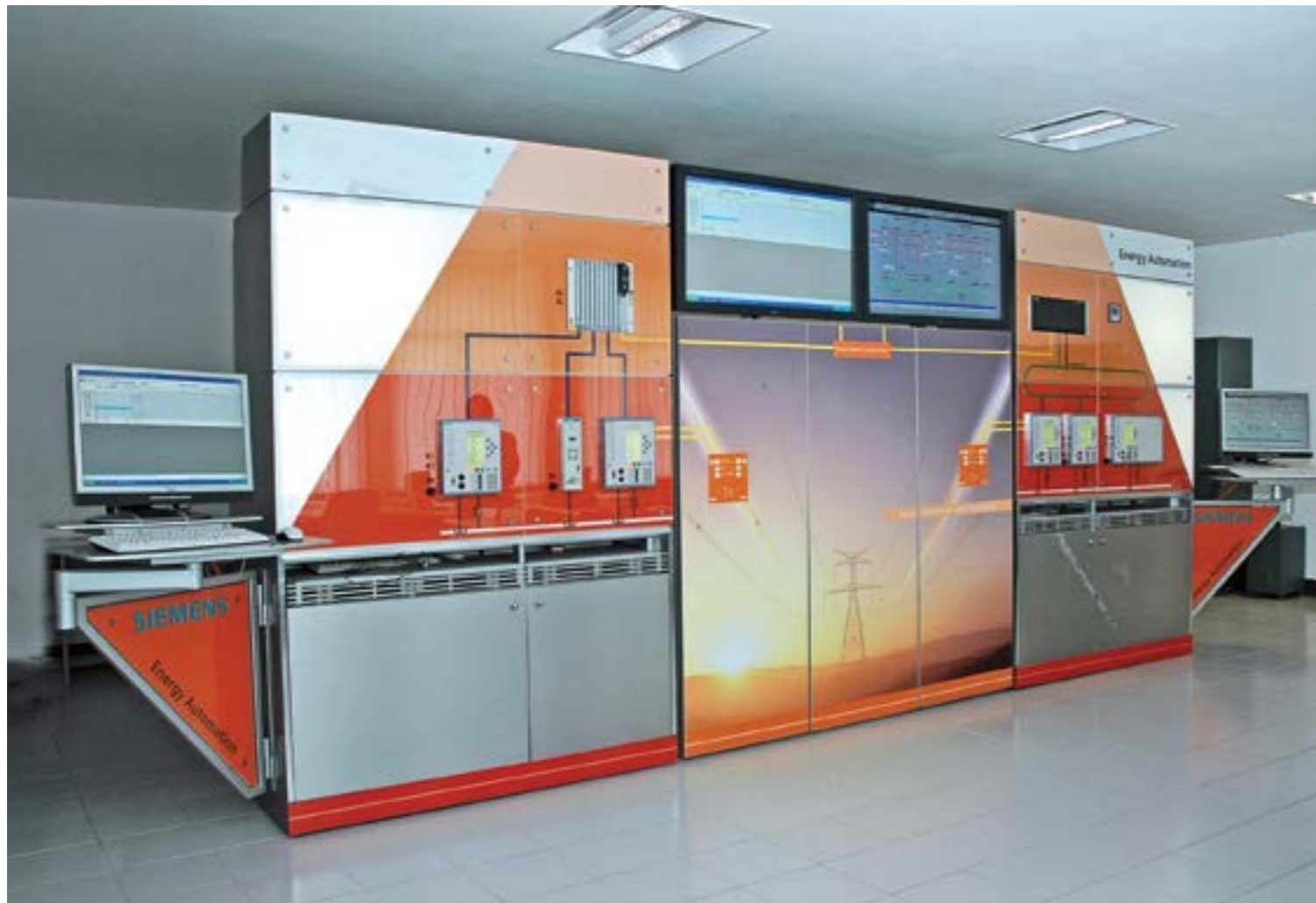
Substation Automation System display panel at L&T's training lab in Chennai

Expertise in transmission line design includes route alignment through Geographic Information System (GIS) using an indigenously developed and patented software. Adding to the decisive advantages is an exclusive substation automation system simulation lab where engineers receive hands-on training in the areas of control and protection.