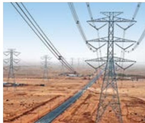
380 kV transmission line at Riyadh in Saudi Arabia

L&T Construction was one of the earliest Indian companies to commence operations in the Gulf and has, over the years, gained significant market presence in UAE, Oman, Qatar, Saudi Arabia, Kuwait and Bahrain for executing power evacuation, transmission and distribution projects on EPC basis. Today, L&T is all set to provide single-window solutions to meet the complex power infrastructure requirements in the Middle East, Africa and ASEAN Region.