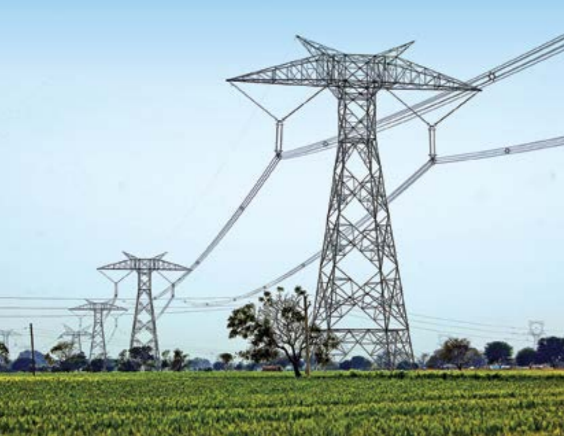
800 kV HVDC Nidhura - Agra transmission line

1 lakh+ km of transmission lines of various voltages