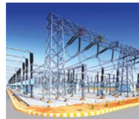
220 kV switchyard at Ranchi for PGCIL