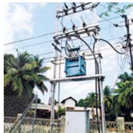
Power quality improvement works