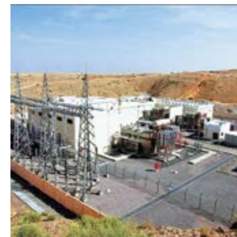
220 kV grid substation at Airport Heights, Oman