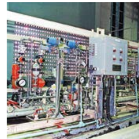
Field instrumentation works