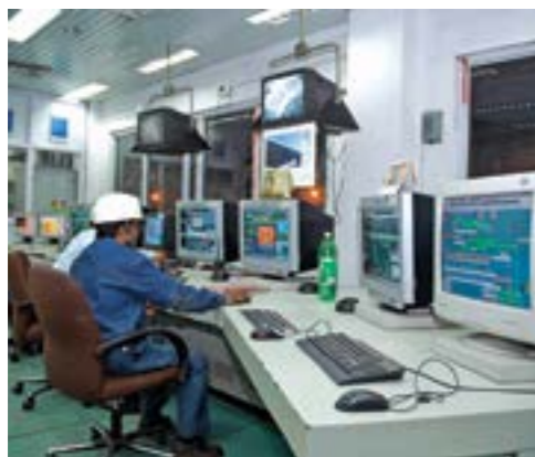
Control system for a sinter plant