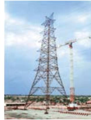
Testing of towers with different capacities in progress