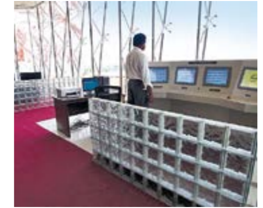
Inside view of the control room