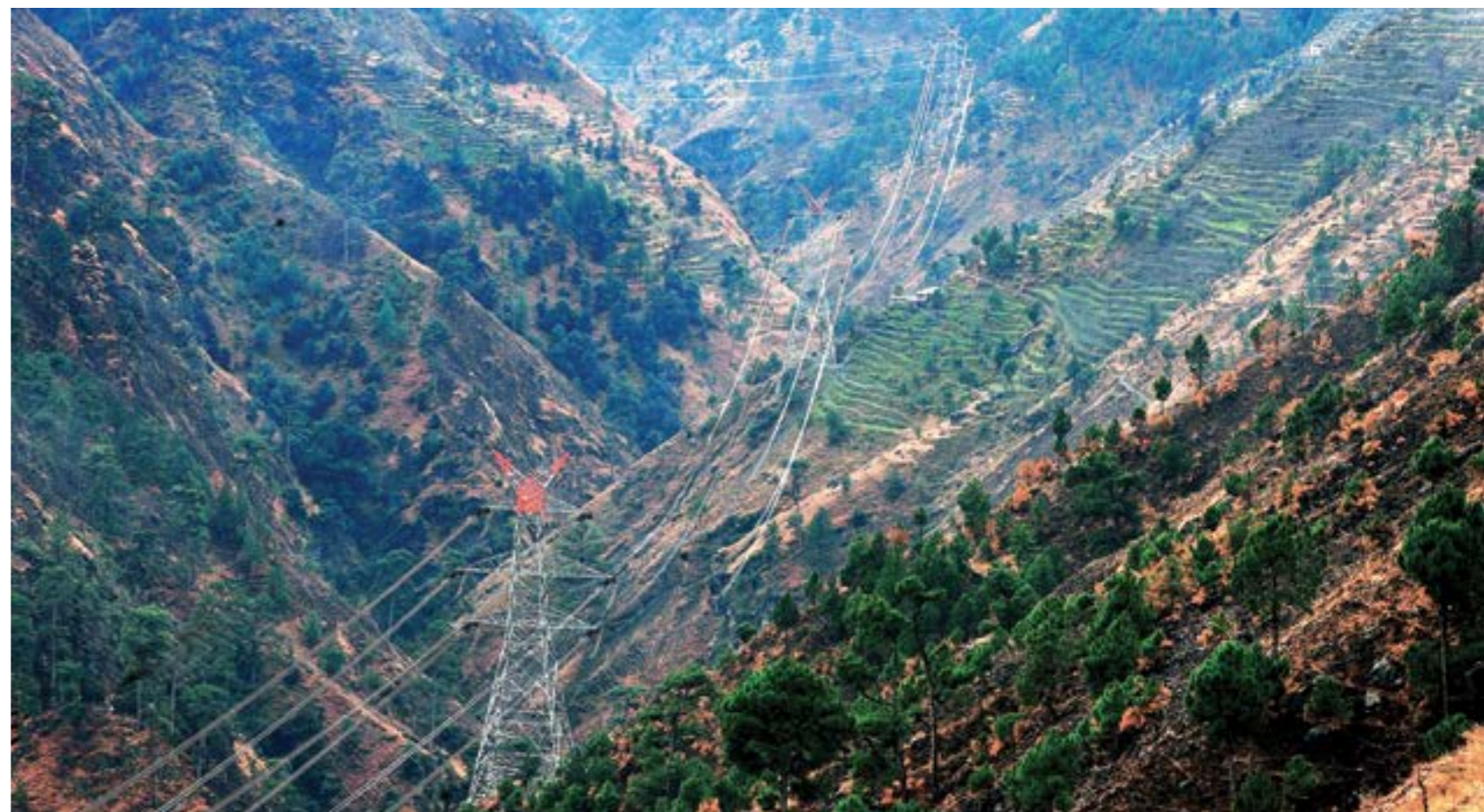
400 kV double circuit Karcham Wangtoo - Abdullapur transmission line

1 lakh+ km of transmission lines of various voltages