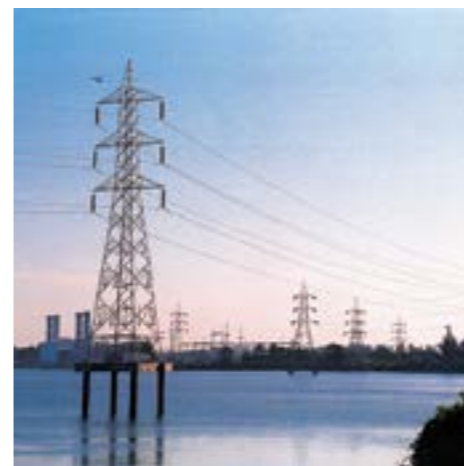
220 kV river crossing transmission line on pile foundations