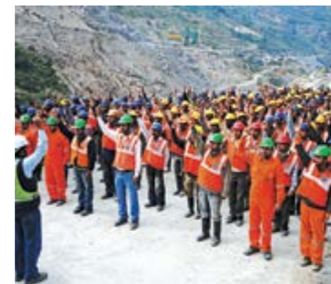
Safety orientation at site