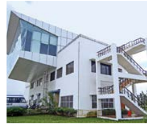
Control tower with a 360° view of the tower testing facility