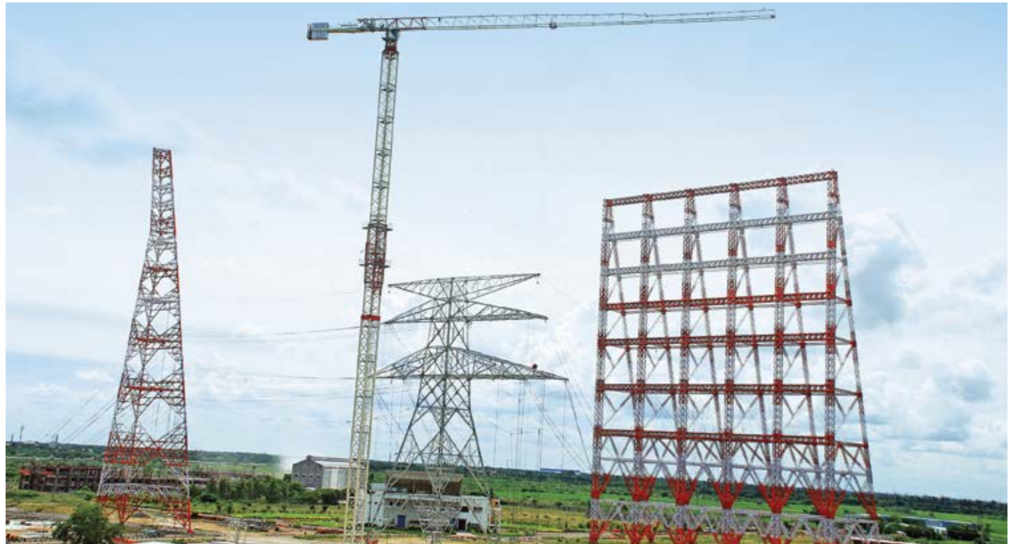
State-of-the-art tower testing station at Kancheepuram, near Chennai

L&T's Transmission Line Testing & Research Station (TLTRS) is one of the largest in the world and India's first private testing station to be accredited by National Accreditation Board for Testing & Calibration Laboratories (NABL). Since inception in November 2009, TLTRS has completed testing of towers for many international clients from Mexico, Malaysia, Spain, Oman, Abu Dhabi, Saudi Arabia and Egypt. Located in Kancheepuram near Chennai, this testing station is equipped with a proto fabrication unit to make modifications on tested towers. It is equipped with facilities to carry out tests on square or rectangular base lattice towers, triangle (telecommunication towers), monopoles, tubular structures and guyed towers for capacities of up to 1200 kV.