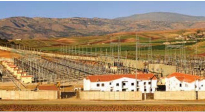
400 kV AIS at Chlef in Algeria