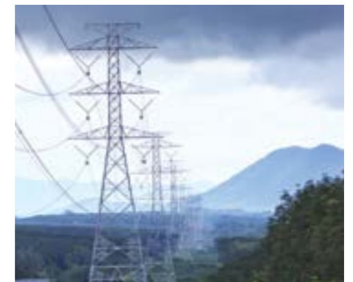
500 kV Tha Li-Khon Kaen 4 transmission line, Thailand