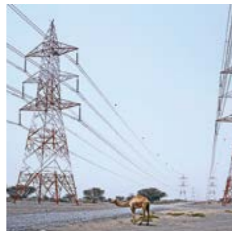
220kV transmission line for Blue City project at Muscat, Oman