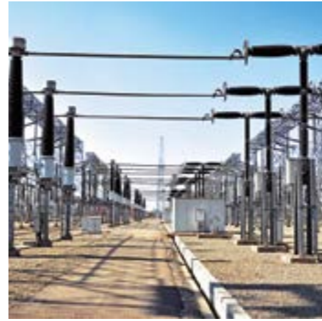
400 kV switchyard for Jindal Power Plant