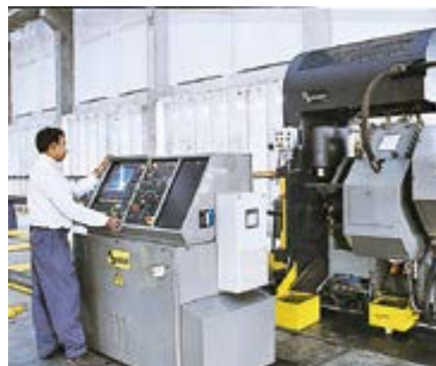
CNC machine in operation

Rolling Mill: To ensure timely availability of quality raw material, a rolling mill of 40,000 mtpa capacity has been set up at the Puducherry factory to produce angles, channels and re-bars.