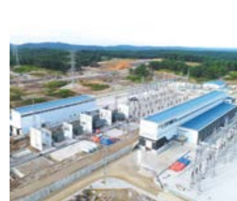
275/132/33 kV GIS at Samalaju in Malaysia