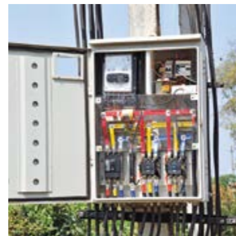
Rural Load Management System (RLMS)